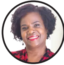
Jacqueline Green Frost Institute for Data Science and Computing