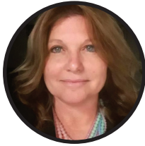
Helen Gynell Frost Institute for Data Science and Computing